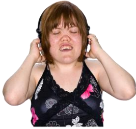
Listen to music