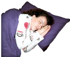
Have a nap