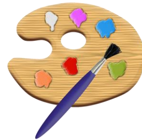
Paint or draw